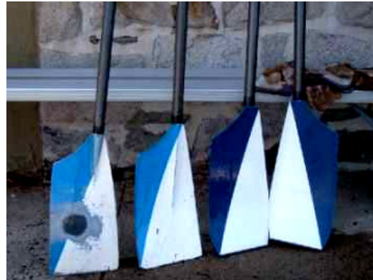
Which is the real and correct FRA blue?